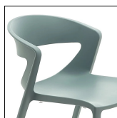
Fiber-glass reinforced polypropylene stackable monoblock chair