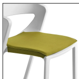
KC10SR Removable and detachable upholstered cushion