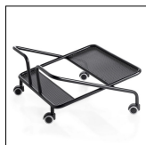
KC17 Black painted trolley