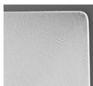
FB White pattern