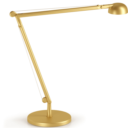
Table lighting fixture for interiors, with swivelling light beam. Pickled sheet metal bearing base in polyacrylic paint. Extruded aluminium frame in white, mat black, bronze, mat brass or titanium polyacrylic paint. Die-cast aluminium joints in polyacrylic paint. Steel wire rope slings. Die-cast aluminium head rotating on two axes in polyacrylic paint. Modelled polycarbonate diffuser with opaline finish and serigraphy. Push-button to adjust luminosity and light shade according to 5 levels of visual comfort. Equipped with a 1,6m (63") long power cable with jack connector and adapter plug.